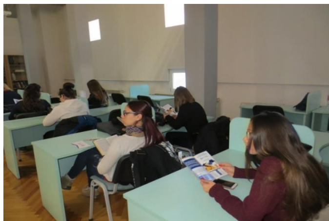
Figure 9: During the session: Lexical Recognition in the Natural Language

On 5th December 2016, during the promotion of printed and digital edition of The Dictionary of the Serbo-Croatian Literary Language and Vernaculars SASA at the Faculty of Philology and Arts (FILUM), University of Kragujevac, one of the courses established within BAEKTEL project was presented.