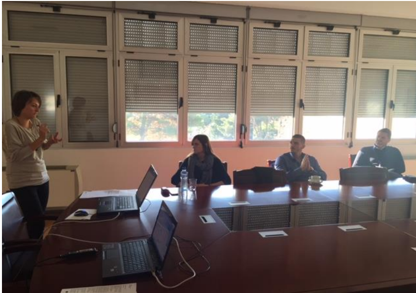
Figure 3: Round table at the Faculty of Information Technology