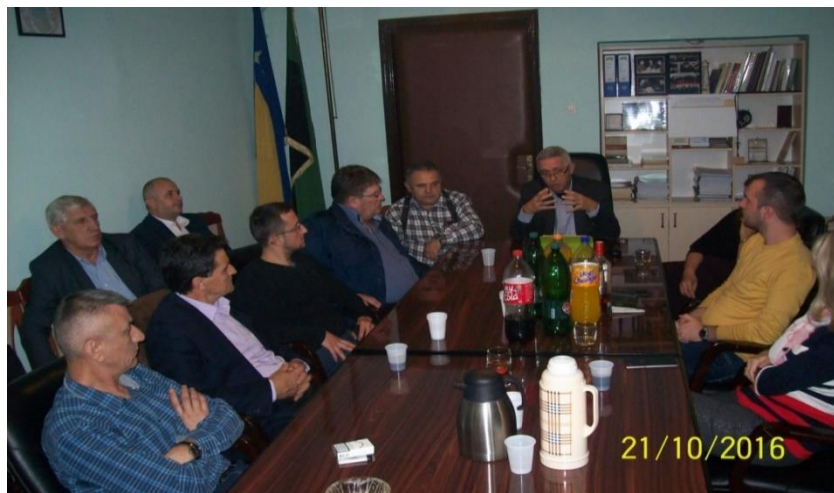
Figure 7: Round table: Open Educational Resources University of Tuzla, Faculty of mining, geology and civil engineering

On the 21 st of October 2016, Faculty of mining, geology and civil engineering, University of Tuzla, was a host of the Roundtable with entrepreneurs which consisted of 17 attendees. Name of the project presented was Blending academic and entrepreneurial knowledge in technology enhanced learning. The first goal of the project was to establish the OER framework in order to inspire technologically enhanced learning (TEL) within the institutions of higher education and lifelong learning in the ZB countries' companies as well as to develop and implement guidelines and procedures aimed at securing OER quality in accordance with EU standards.