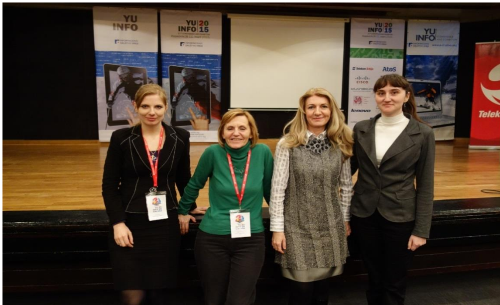
Figure 2: Participants of the Session: Massive Open Online Courses: edX vs Moodle MOOC

The BAEKTEL project results were disseminated at the International Conference on Information Society and Technology (ICIST 2015) held on Kopaonik, Serbia on March 8-11, 2015. The main objective of the conference was to provide a platform for ICT oriented researchers and practitioners from all over the world to present their research results and development activities. ICIST special focus was at the Future Internet Technologies, Architectures and Applications. During the conference the paper titled “Massive Open Online Courses: edX vs Moodle MOOC”, with results obtained in the framework of Tempus BAEKTEL project, was presented. The presentation was performed under the topic: Learning Management Systems. Also, the participants were able to learn about the results from comparative analysis of edX and Moodle MOOC pointing out weakness and strengths of both platforms.