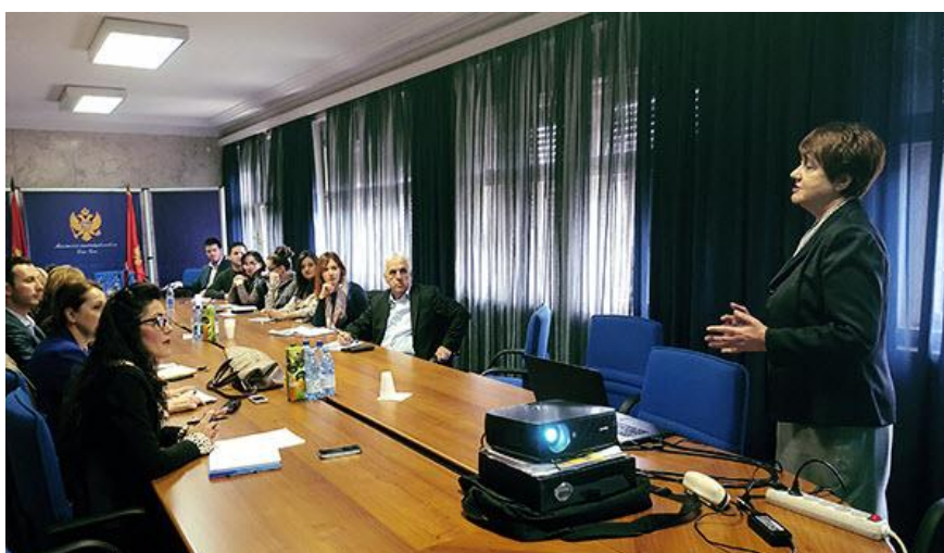
Figure 10: Round tables with stakeholders, Faculty of Information Technology

On 10 th and 11 th of March 2017 series of meetings and roundtables with different stakeholders were organised at the University Mediterranean in order to present the final results of BAEKTEL project. The representatives of HEI, relevant ministries and business industry were present.