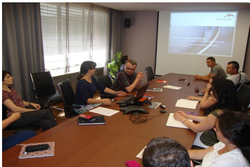
Figure 6: “Are you ready for Action 2020?”, Prijedor

For the fourth consecutive year, ArcelorMittal celebrated lifelong learning and development during company-wide Learning Week. This year, the event took place from June 13th to 17th with the theme “Are you ready for Action 2020?” Within the Learning week scope several activities and events have been organized, among others a presentation and promotion of the BAEKTEL Project to ArcelorMittal employees. The presentation of the project was attended by the younger professionals from backgrounds of mining, geology, environment protection, mechanics, finance, legal and other backgrounds, being a potential users of the project platform in the future.