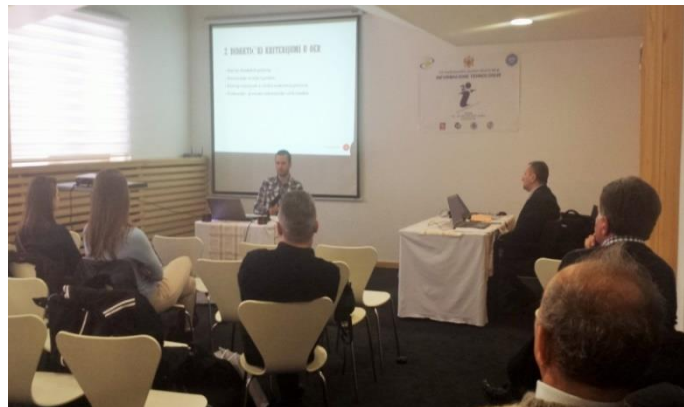
Figure 1: Round table at the IT' 15 Conference held in Žabljak, Montenegro